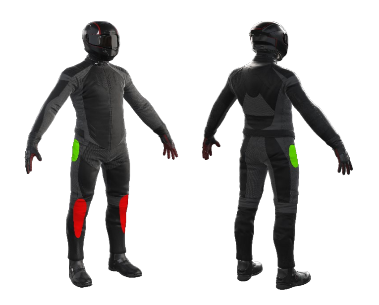
Impact Protection Performance Impact rating 4/10 Impact score 25.9

These pants were tested for impact protection and coverage in accordance with MotoCAP test protocols. The diagram below is a visual indication of the likely performance of each impact protector calculated from the data in the table below. The colour coding is based on the worst performing score for average or maximium force for each impact zone. Areas shaded black are not considered for impact protection ratings.