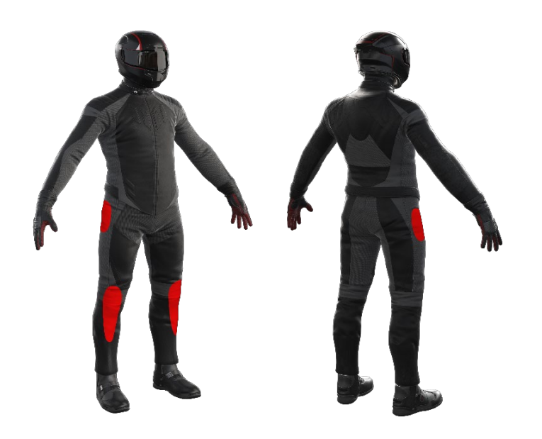
Impact Protection Performance

These pants was not tested for impact protection as impact protectors were not provided with the garment. The diagram below is a visual indication of the likely performance of each impact protector calculated from the data in the table below. The colour coding is based on the worst performing score for average or maximium force for each impact zone. Areas shaded black are not considered for impact protection ratings.