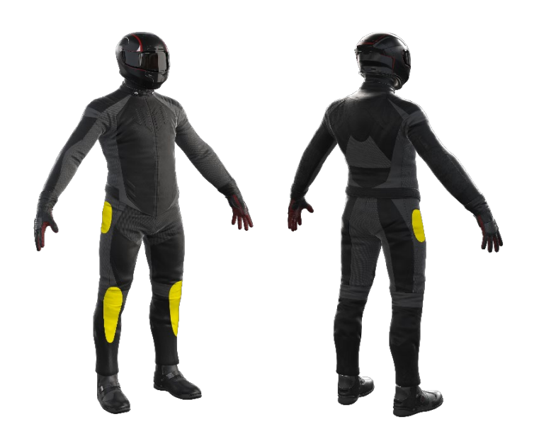
Impact Protection Performance Impact rating 7/10 Impact score 48.5

These pants were tested for impact protection and coverage in accordance with MotoCAP test protocols. The diagram below is a visual indication of the likely performance of each impact protector calculated from the data in the table below. The colour coding is based on the worst performing score for average or maximium force for each impact zone. Areas shaded black are not considered for impact protection ratings.