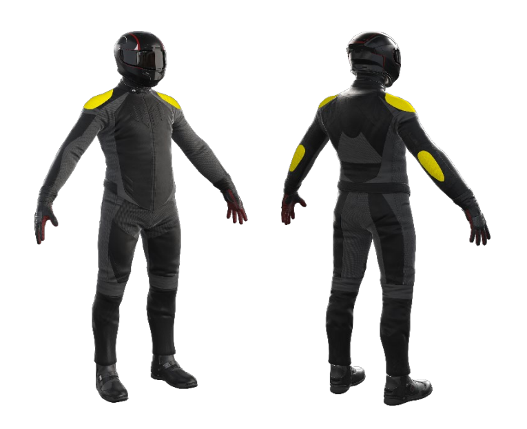
Impact Protection Performance Impact rating 5/10 Impact score 38.3

The jacket was tested for impact protection and coverage in accordance with MotoCAP test protocols. The diagram below is a visual indication of the likely performance of each impact protector calculated from the data in the table below. The colour coding is based on the worst performing score for average or maximium force for each impact zone. Areas shaded black are not considered for impact protection ratings.