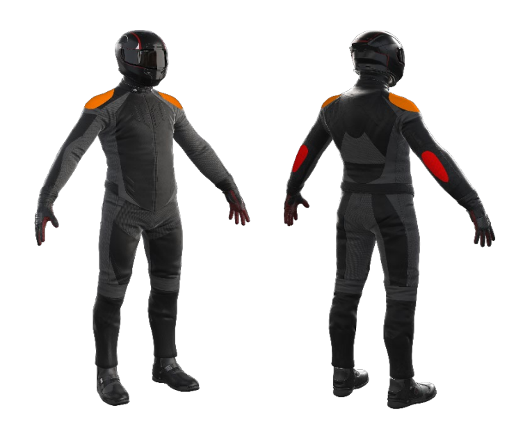
Impact Protection Performance Impact rating 6/10 Impact score 44.9

The jacket was tested for impact protection and coverage in accordance with MotoCAP test protocols. The diagram below is a visual indication of the likely performance of each impact protector calculated from the data in the table below. The colour coding is based on the worst performing score for average or maximium force for each impact zone. Areas shaded black are not considered for impact protection ratings.