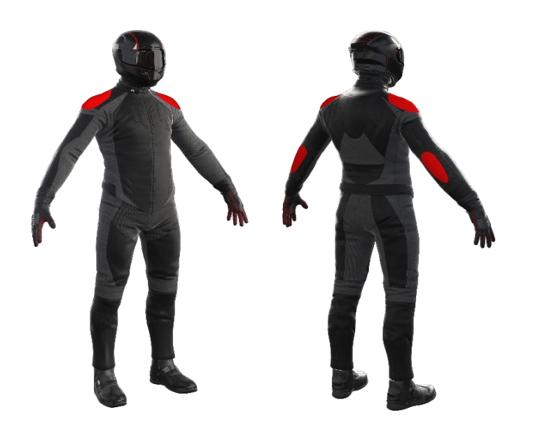
Impact Protection Performance Impact rating 3/10 Impact score 23

The jacket was tested for impact protection and coverage in accordance with MotoCAP test protocols. The diagram below is a visual indication of the likely performance of each impact protector calculated from the data in the table below. The colour coding is based on the worst performing score for average or maximium force for each impact zone. Areas shaded black are not considered for impact protection ratings.